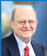
Commissioner Jim Malinowski