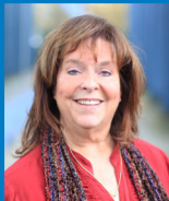
Commissioner Nancy Barnes